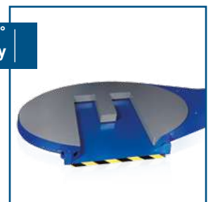
90° / 180° / 270° Entry

3000 mm max wrapping height Remote control Photocell for dark loads Clip to tie the film to the turntable Safety fences