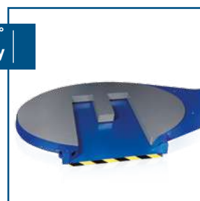
90° / 180° / 270° Entry

3000 mm max wrapping height Remote control Photocell for dark loads Clip to tie the film to the turntable Safety fences